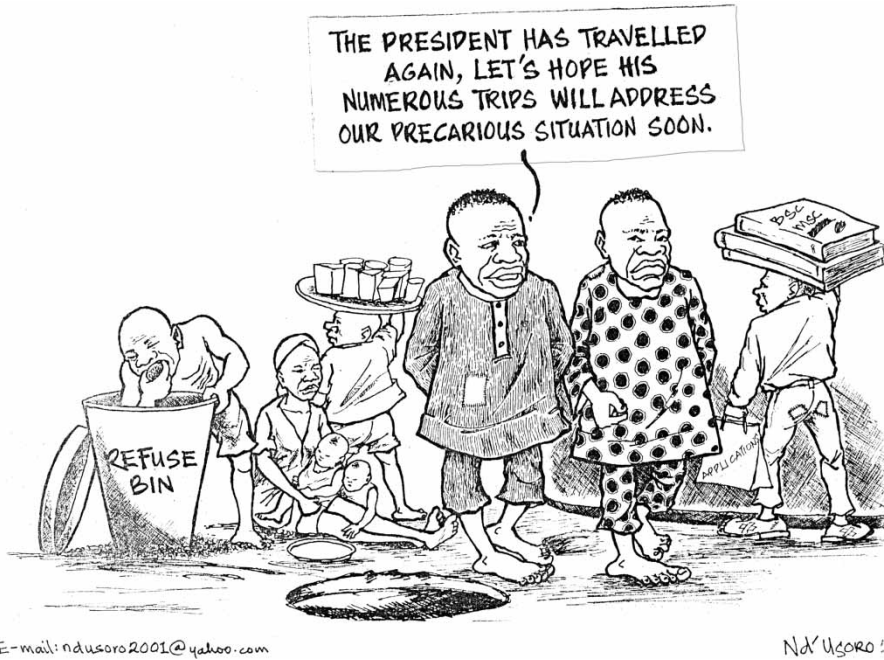
Figure 3. Satirical cartoon by Nd'Urso.

administrative structure called Lagos State under military control. In the wake of the two-and-a-half-year Nigerian civil war which broke out in 1967, the city's difficulties were further exacerbated by huge waves of migration from eastern parts of the country. The civil war, fostered in part by secessionist attempts to control newly discovered oil resources, resulted in an intensified militarisation of Nigerian politics and a shift from the colonial legacy of 'indirect rule' towards a new form of 'authoritarian governmentality' stemming in part from a political compromise between the Muslim north—where the army drew its main sources of support—and the concentration of commerce and natural resources in the mainly Christian south.