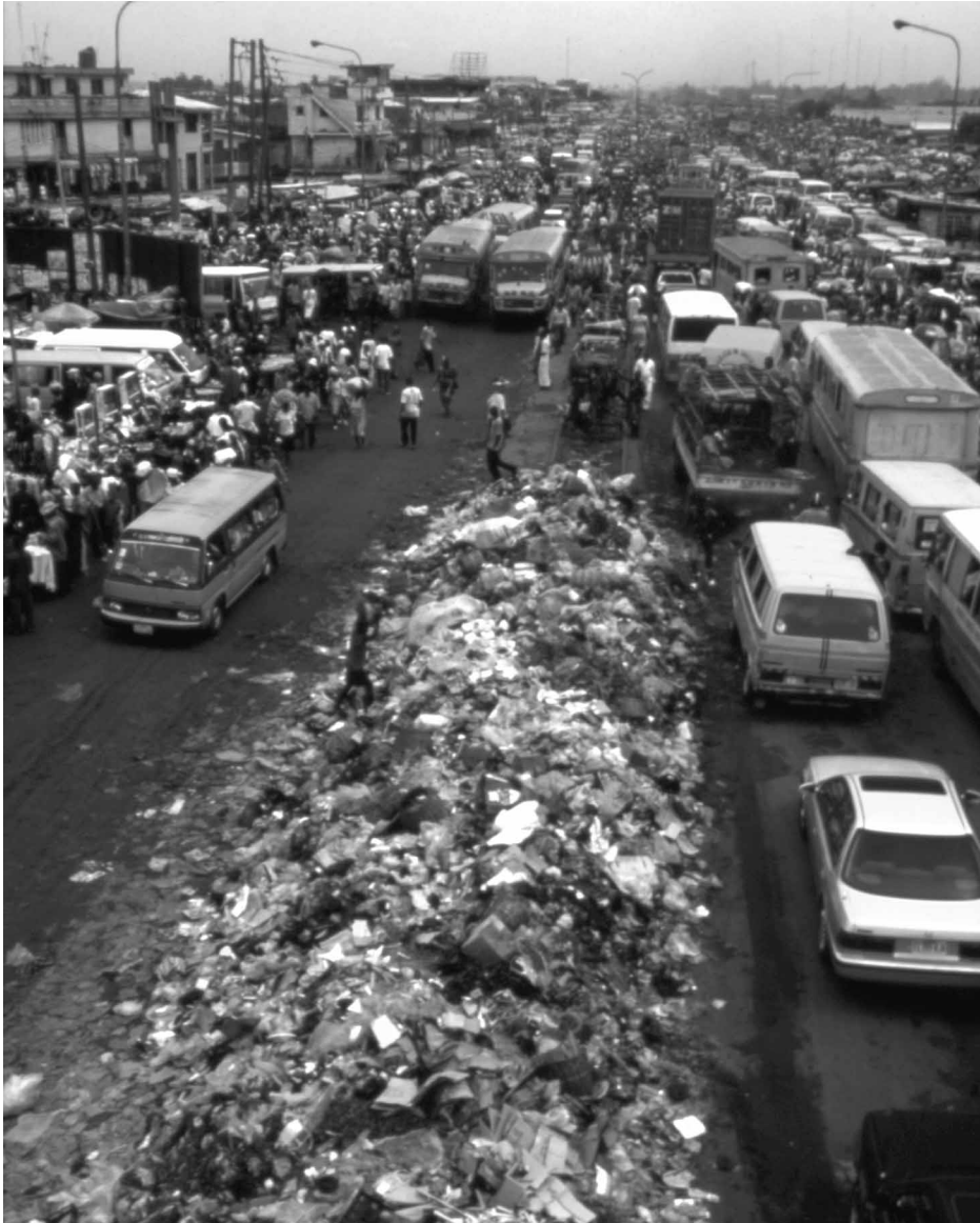
Figure 2. Transport chaos and uncollected garbage in Oshodi Market, May 2003.

the construction of prestige projects such as the National Theatre in 1977 and the city's continuing inability to provide basic infrastructure.