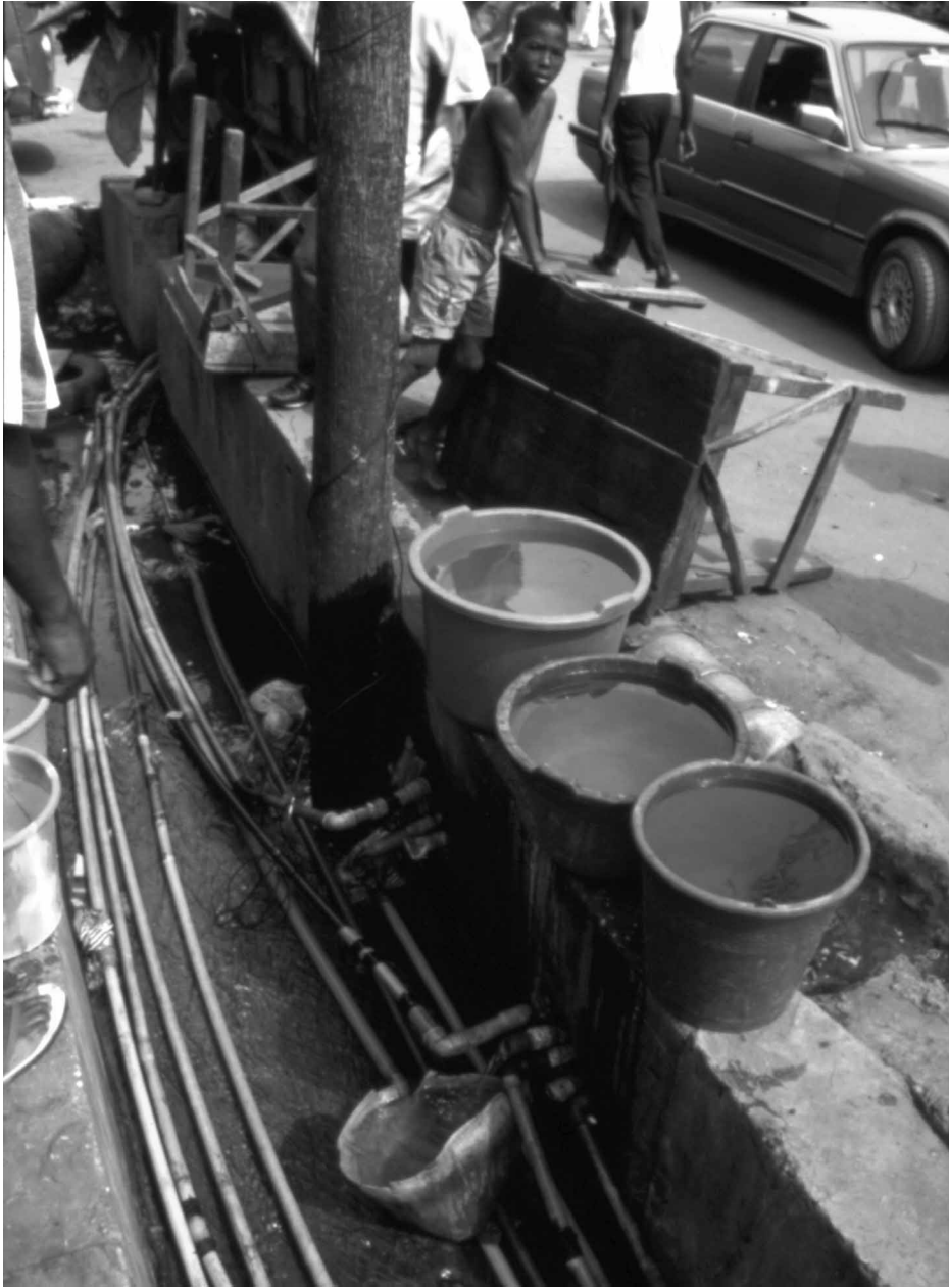
Figure 4. Illegal water connections and street sales of water in Ajegunle, February 2003.

architectural forum Central Intelligence Agency and the urban environmental group Metamorphis Nigeria have made demands for an improvement in urban conditions and have become a significant element in new forms of civic mobilisation facilitated by the